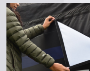
CUSTOM BRANDED PANEL #4240