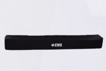
ROLLING DUFFEL #4425